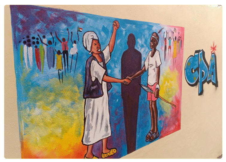
A painting by Akot Solip titled "CPA" showcasing the signing of the Comprehensive Peace Agreement in 2005.